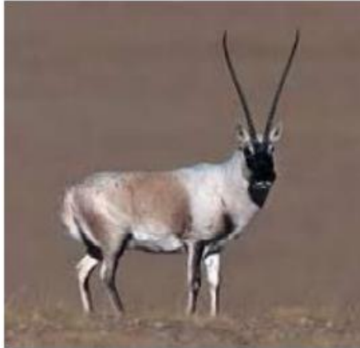
A Tibetan Antelope