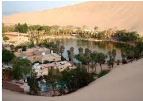
Many people in the desert regions settle around an oasis