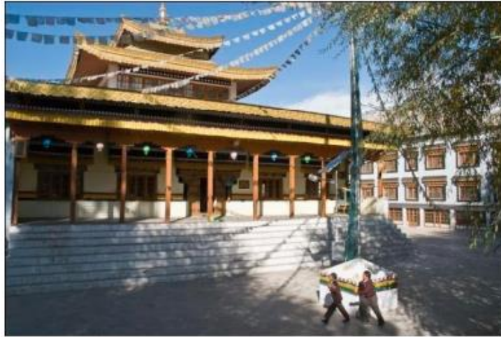
A Buddhist Monastery